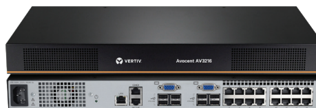
AV3216: Vertiv™ Avocent® AutoView™ 32-port switch