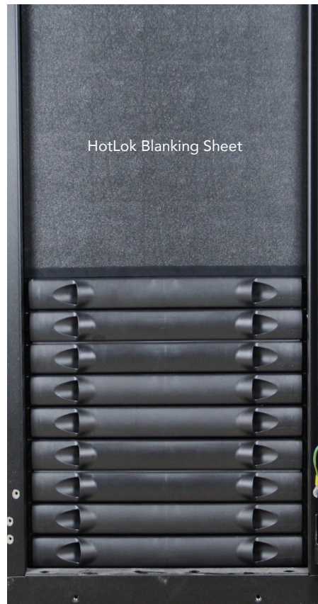
Additional 1U and 2U Blanking Panels for sealing racks up to 50U

Mounting Extrusion: Rigid PVC Blanking Sheet: ABS Fire Rating: UL 94 HB Fire Resistant Compliance: RoHS Compliant